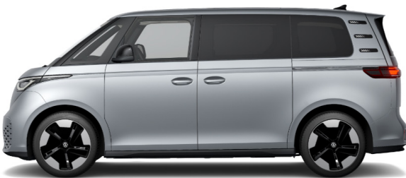
Mono Silver Metallic 1 K9K9