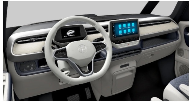
X-Blue-Mistral/Soul-Mistral/Black Standard on ID.Buzz Family onward Not available on ID.Buzz Life