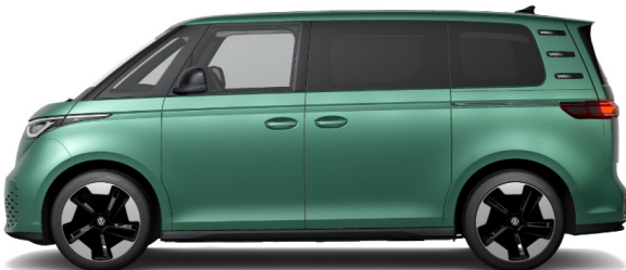
Bay Leaf Green Metallic 1 C4C4