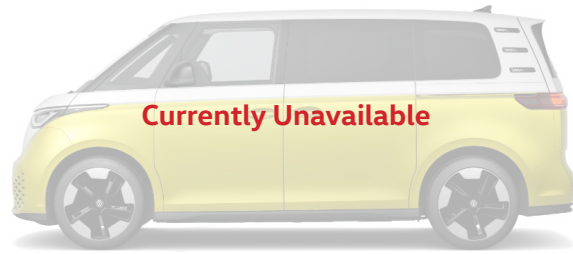
Candy White/ Pomelo Yellow Metallic 1 9192 RRP €2,060