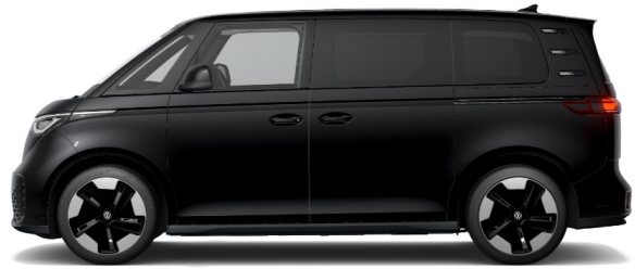
Deep Black Pearl Effect 1 2T2T