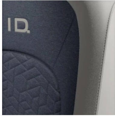
'Seaqual' seat trim X-Blue-Mistral/Soul-Mistral/Black Standard on ID.Buzz Family onward Not available on ID.Buzz Life