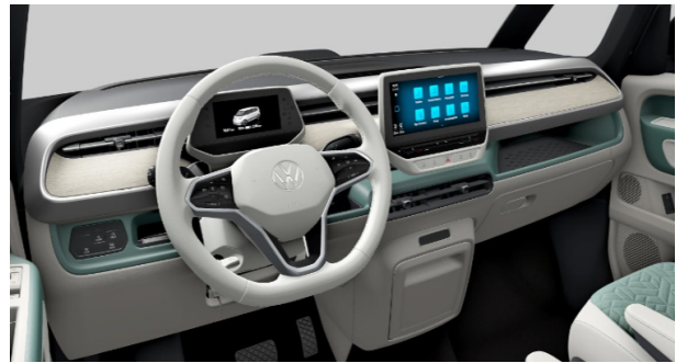
Jade-Mistral/Soul-Mistral/Black Standard on ID.Buzz Family onward Not available on ID.Buzz Life