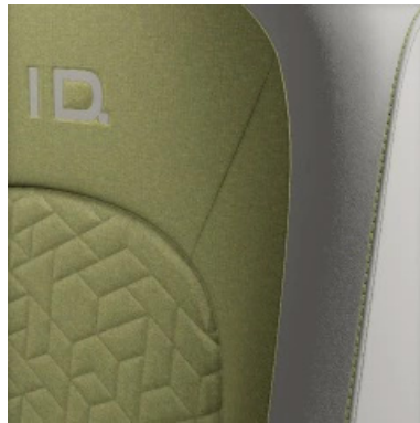
'Seaqual' seat trim Lemon-Mistral/Soul-Mistral/Black Standard on ID.Buzz Family onward Not available on ID.Buzz Life