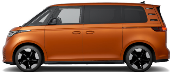
Energetic Orange Metallic 1 4M4M