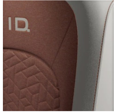
'Seaqual' seat trim Saffron Orange-Mistral/Soul-Mistral/ Black Standard on ID.Buzz Family onward Not available on ID.Buzz Life