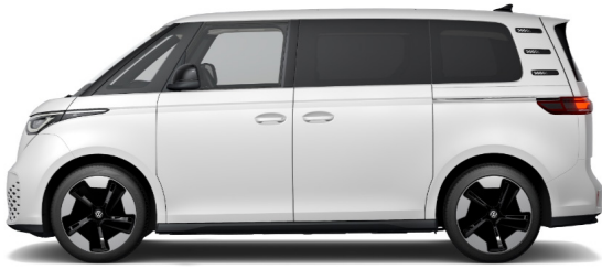
Candy White Solid 1 B4B4