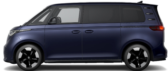
Starlight Blue Metallic 1 3S3S