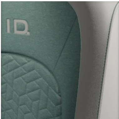
'Seaqual' seat trim Jade-Mistral/Soul-Mistral/Black Standard on ID.Buzz Family onward Not available on ID.Buzz Life