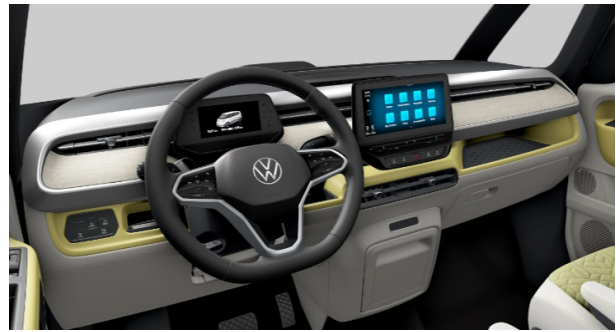
Black Steering Wheel & Infotainment Surround Optional on ID.Buzz Family onward Standard on ID.Buzz Life

Note: Interior trim colours for ID.Buzz Family onward are determined by exterior colour selection Note: The print processes does not allow exact reproduction of the upholstery & insert colours.