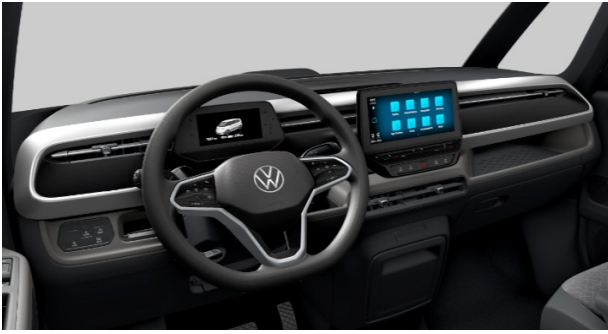
Palladium-Soul/ Soul-Soul/ Black Standard on ID.Buzz Life Not available on ID.Buzz Family onward