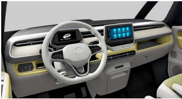
Lemon-Mistral/Soul-Mistral/Black Standard on ID.Buzz Family onward Not available on ID.Buzz Life