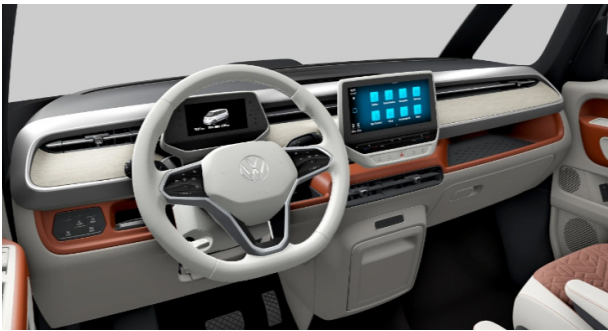
Saffron Orange-Mistral/Soul-Mistral/ Black Standard on ID.Buzz Family onward Not available on ID.Buzz Life