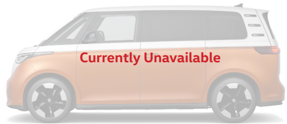
Candy White/ Energetic Orange Metallic 1 9218 RRP €2,060