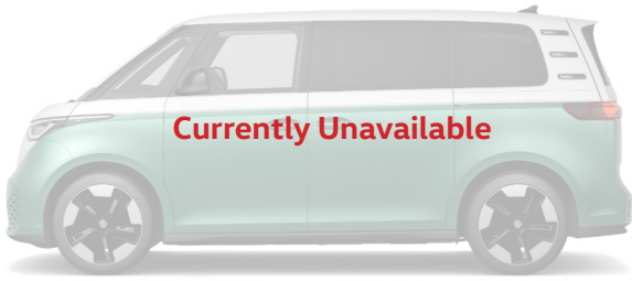
Candy White/ Bay Leaf Green Metallic 1 9675 RRP €2,060