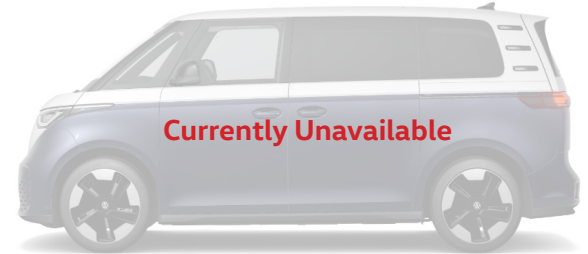
Candy White/ Starlight Blue Metallic 1 9530 RRP €2,060