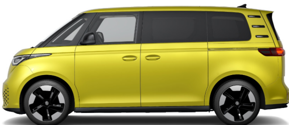
Pomelo Yellow Metallic 1 C1C1