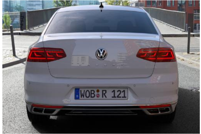
Note: The above image shows 'R-Line' Model with optional Matrix LED package.