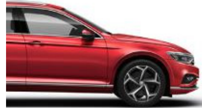
Tornado Red Solid* G2G2