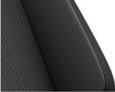
"Lizard" cloth Titan Black/Blue (TO) Standard on Passat models