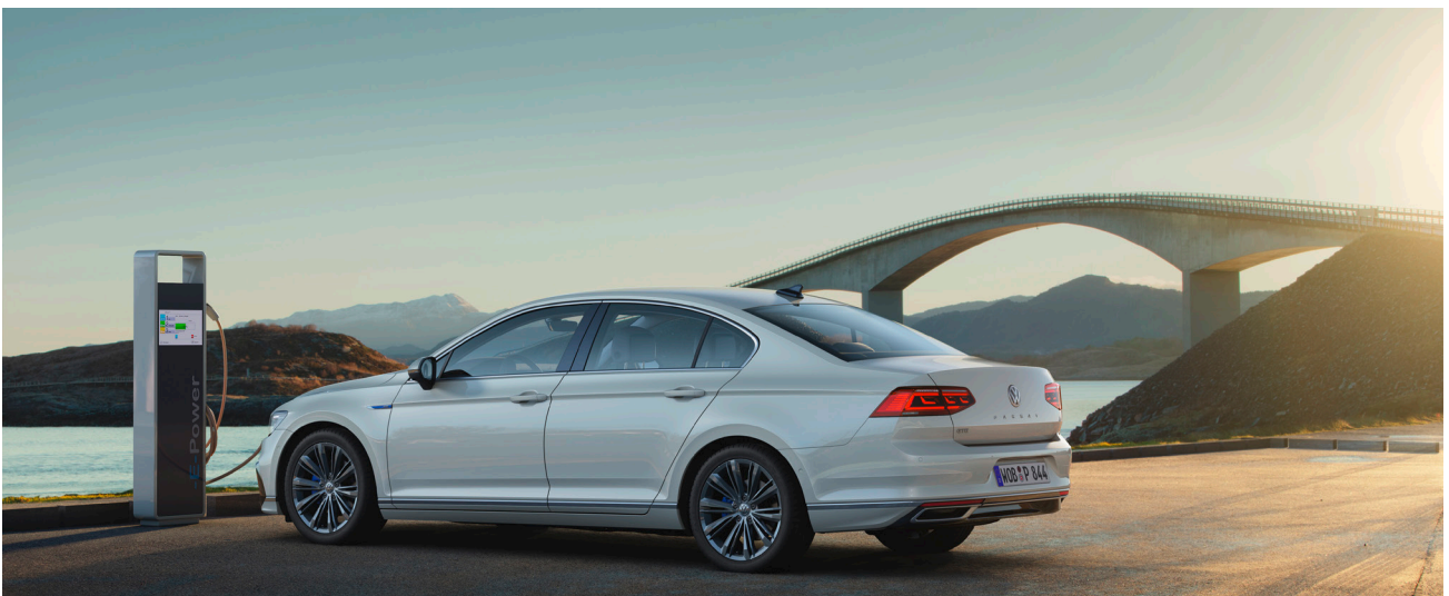
Note: The above image shows Passat GTE with optional "Liverpool" 18" alloy wheels in adamantium dark

The above specifications are for information purposes only as our products are continually updated and changes may be made to the specifications at any time. If you require any specific feature, you must consult your local dealer who is regularly updated with any change in specification. Specifications are subject to change without notice.