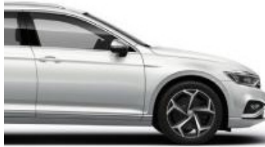
Pure White Solid* 0Q0Q