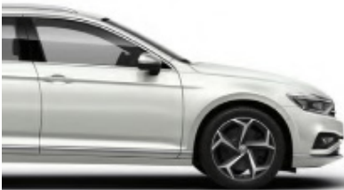
Oryx White Pearl Effect* 0R0R Note: Not available on Passat and Passat Business