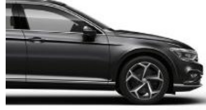
Manganese Grey Metallic* 5V5V