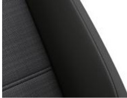
"Weave" cloth Titan Black/Blue (TO) Standard on Business models