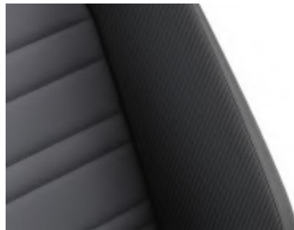
"Carbon-Flag"/Vienna (W05) Flint Grey/Titan Black (OK) Optional on R-Line