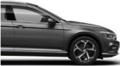
Urano Grey Solid 5K5K