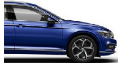
Lapiz Blue Metallic* L9L9 Note: Only available on R-Line

Note: Oryx White is a premium pearl effect paint finish. Please see Options section for pricing information.