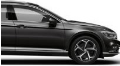
Deep Black Pearl Effect* 2T2T