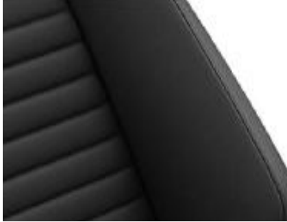
"Nappa" leather (WL7) Titan Black/Blue(TO) Optional on Elegance/ R-Line