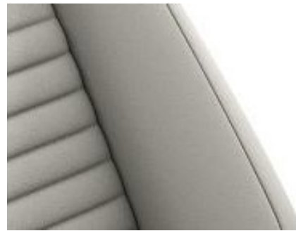
"Alcantara" / "Vienna" leather Mistral (YR) Standard on Elegance/ R-Line