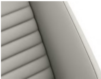
"Nappa" leather (WL7) Mistral (YR) Optional on Elegance and R-Line