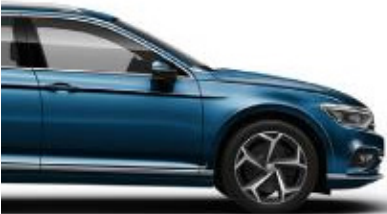
Aquamarine Metallic* 8H8H