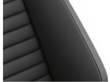
"ArtVelours" / "Vienna" leather Titan Black/Blue (TO) Standard on Elegance/ R-Line