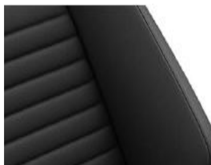
"Nappa" leather (WL8) Titan Black/Blue(TO) Standard on GTE

Note 1: Some parts of leather interior trim will contain artificial leather. Note 2: The print processes do not allow exact reproduction of the upholstery & insert colours.