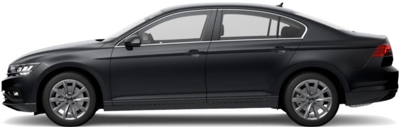
Note: Above shows Passat Business with optional "Deep Pearl Black" paint