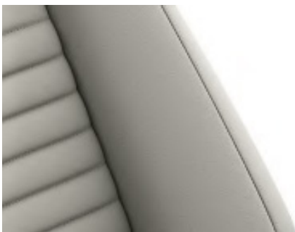
"Vienna" leather (WL1) Mistral (YR) Optional on Business models