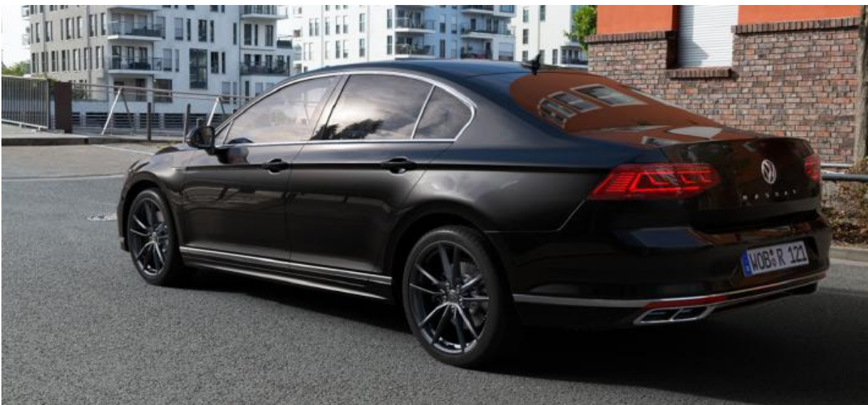
Note: The above image shows 'R-Line' Model with optional 'Pretoria' 19" alloy wheels in optional Matte Dark Graphite paint and optional Matrix LED package.

The above specifications are for information purposes only as our products are continually updated and changes may be made to the specifications at any time. If you require any specific feature, you must consult your local dealer who is regularly updated with any change in specification. Specifications are subject to change without notice. Effective from 25 May 2021, for production from CW48/2020 onwards. All prices include VAT and VRT. These prices are subject to change once technical data comes available.