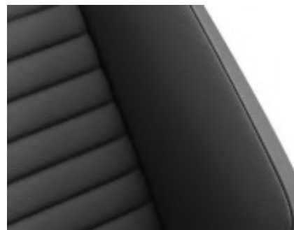
"Vienna" leather (WL1) Titan Black/Blue (TO) Optional on Business models

Note 1: Some parts of leather interior trim will contain artificial leather. Note 2: The print processes do not allow exact reproduction of the upholstery & insert colours.