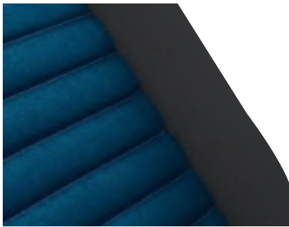
"Alcantara" / "Vienna" leather Aquamarine/Titan Black (CM) Standard on Elegance/ R-Line