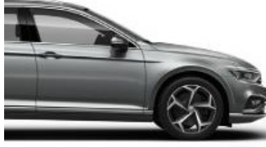
Pyrite Silver Metallic* K2K2