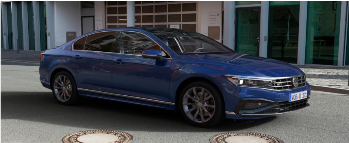
Note: The above image shows 'R-Line' in Lapiz Blue with 'Monterrey' 18" alloy wheels in Grey Metallic and optional Matrix LED package.